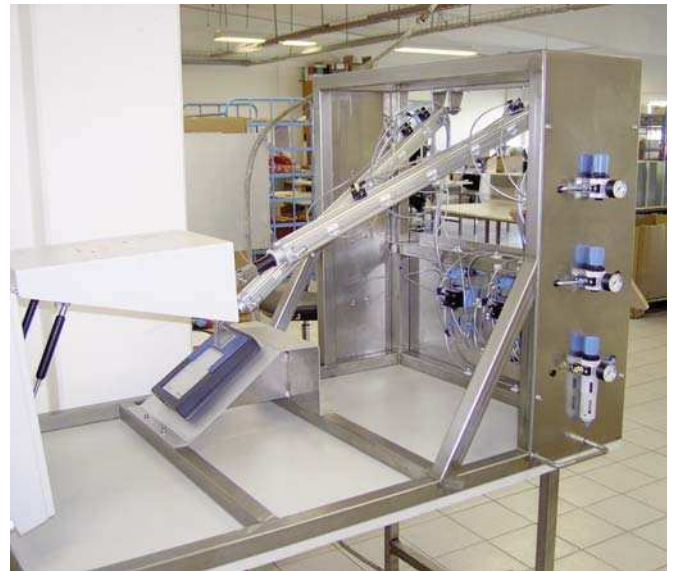
Mechanical life test of the 4921 RF Shield

Most third-generation (3G) mobile phone systems are based on CDMA technology, which puts new demands on test environments compared to TDMA systems. Measurements in CDMA systems require 80 dB of shielding because the mobile will attempt to lock onto the strongest base station. Without the RF Shield, the mobile would hence ignore the test close to the sensitivity level of the mobile receiver and severely affect test results. Testing the receiver via the antenna requires the phone to be isolated from a real base station by 80 dB; without shielding, the mobile could receive the signal from a close-by network transmitter at -25 dBm while trying to detect a test signal at -104 dbm.