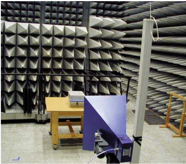
4921 RF Shield with transmitting antenna in EMC laboratory

Most third-generation (3G) mobile phone systems are based on CDMA technology, which puts new demands on test environments compared to TDMA systems. Measurements in CDMA systems require 80 dB of shielding because the mobile will attempt to lock onto the strongest base station. Without the RF Shield, the mobile would hence ignore the test close to the sensitivity level of the mobile receiver and severely affect test results. Testing the receiver via the antenna requires the phone to be isolated from a real base station by 80 dB; without shielding, the mobile could receive the signal from a close-by network transmitter at -25 dBm while trying to detect a test signal at -104 dbm.