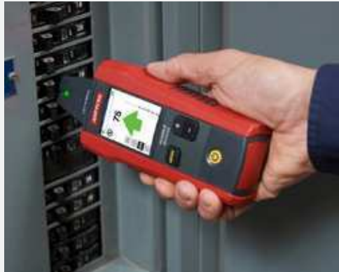
Reduce downtime with immediate and unambiguous breaker identification