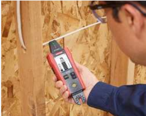
Most accurate wire tracing in its class with eight sensitivity modes