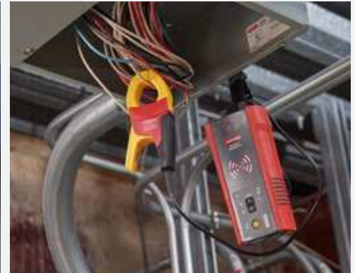
Intuitive transmitter automatically senses whether the system is energized or de-energized