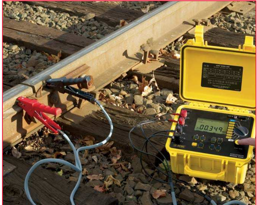
Verifying rail bonds with the Model 6250