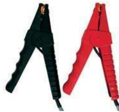
Kelvin clips, set of two, (10A) 10 ft Catalog #1017.84