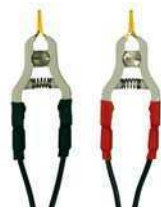
Kelvin clips, set of two, (1A) 10 ft Catalog #1017.83