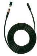
RTD Temperature Probe with 7 ft extension cable Catalog #2129.96