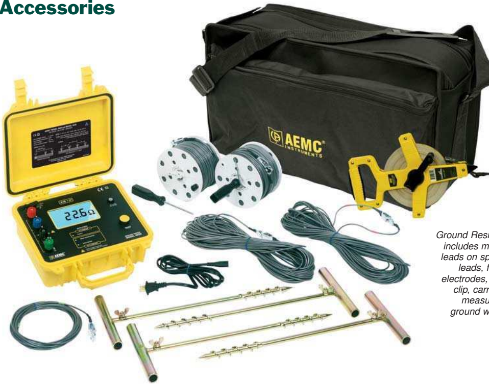
Ground Resistance Tester Model 4630 Kit includes meter, two 300 ft color-coded leads on spools, two 100 ft color-coded leads, four 16" auxiliary ground electrodes, one 16 ft lead with Mueller® clip, carrying bag, one 100 ft tape measure, one AC power cord, ground workbook and user manual