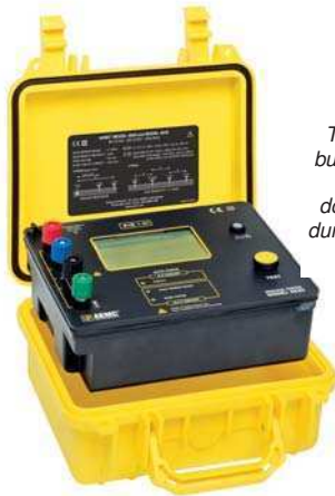
The Models 4620 and 4630 are built into a double case. This extra rugged construction provides double insulation, maximum field durability and ease of serviceability.