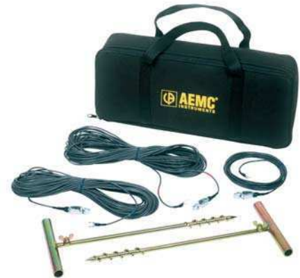
Ground Test Kit – 3-Point (supplemental 4-Point) includes carrying bag, two 100 ft color-coded leads, one 16 ft lead and two 16" auxiliary ground electrodes Catalog #2130.61