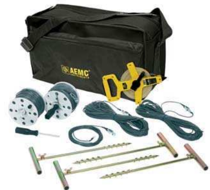
Test Kit – 4-Point includes carrying bag, two 300 ft color-coded leads on spools, two 100 ft color-coded leads, four 16" auxiliary ground electrodes, one 16 ft lead with Mueller® clip and one 100 ft tape measure Catalog #2130.63