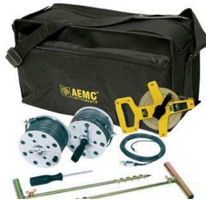
Test Kit – 3-Point includes carrying bag, two 150 ft color-coded leads on spools, two 16" auxiliary ground electrodes, one 16 ft lead with Mueller® clip and one 100 ft tape measure Catalog #2130.62