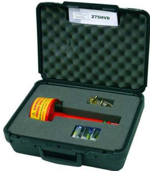
Model 275HVD includes three C cell batteries, a hard carrying case and user manual