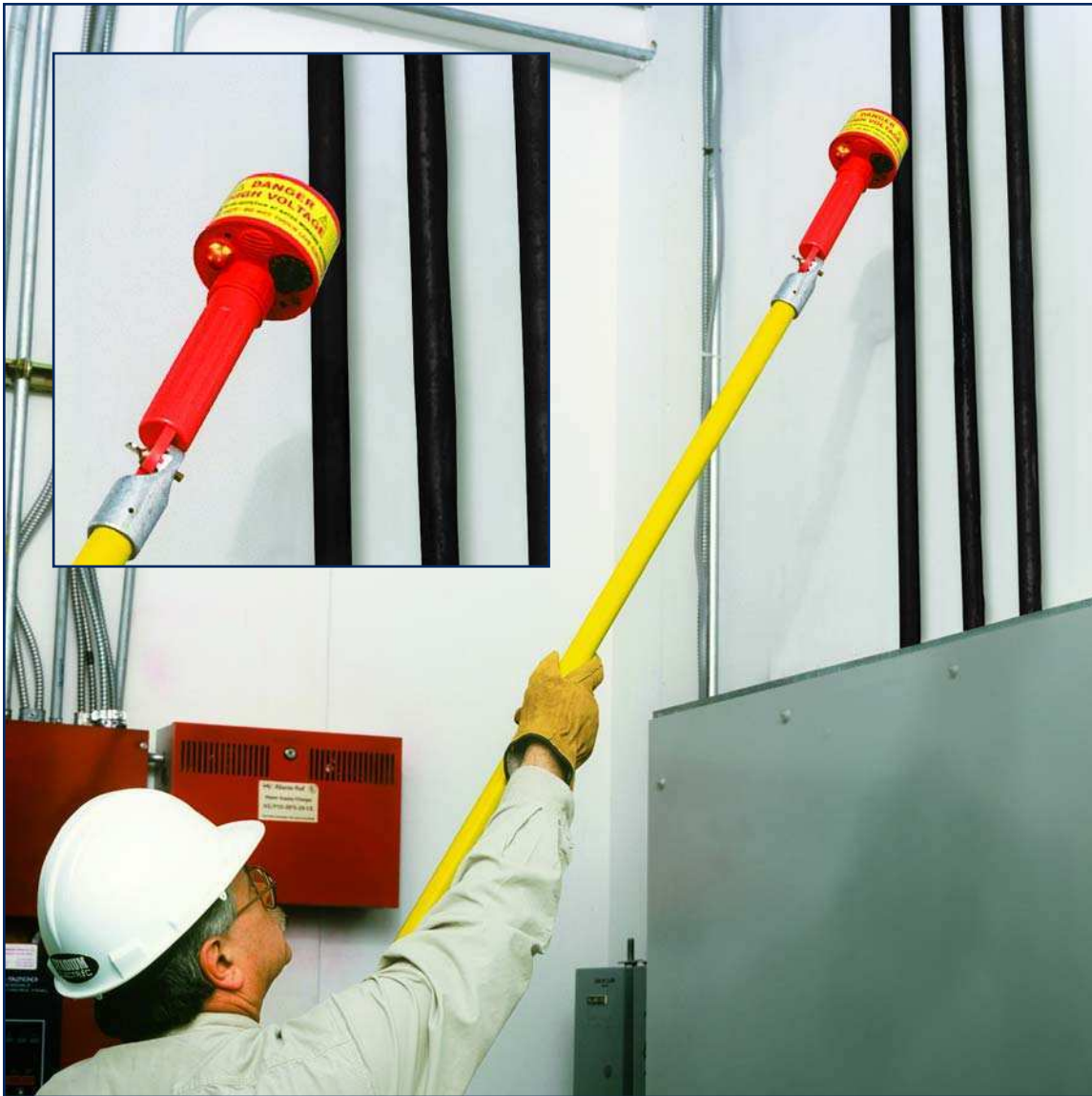
Model 275HVD checking for live voltage on main feeder