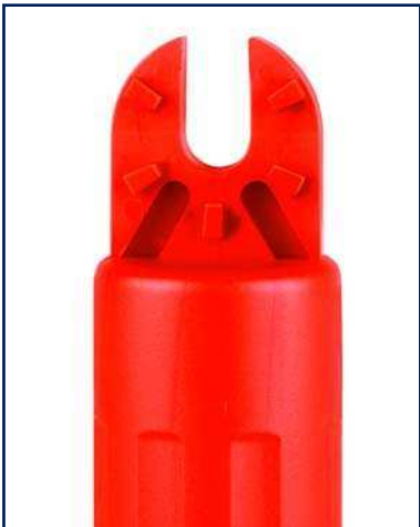
Universal spline for hot stick connection