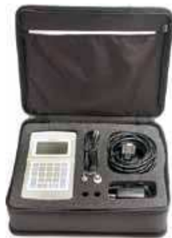
Optional Soft Case 6015-1002

For a complete and current list of testing adapters, terminations, and other accessories visit www.aeatechnology.com/products/accessories