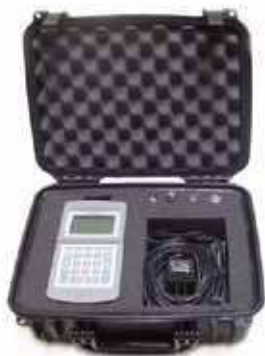
Optional Hard Case 6015-1003